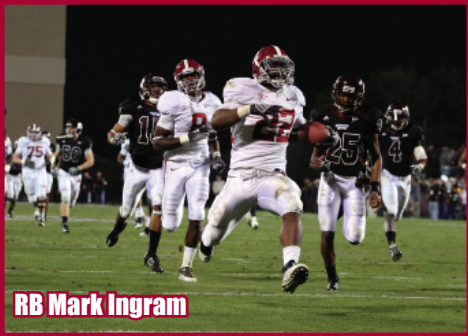
RB Mark Ingram